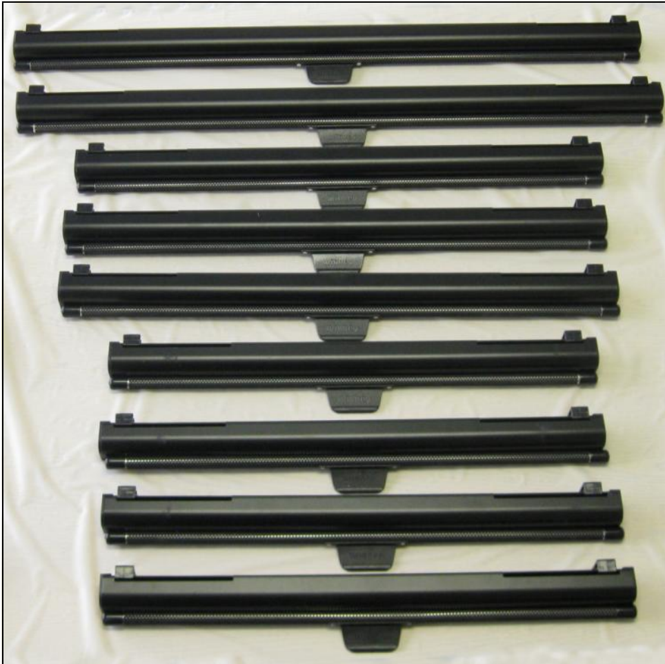
The kit includes from top, two 22233167, three 22233165 and four 22233166 shades.

For use on all Nordco SP2R Spike Puller; AA2R Anchor Adjuster; RPI Ride-On Plate Inserter; Quad Drill; NVCAR V-Clip Applicator with extended cab.