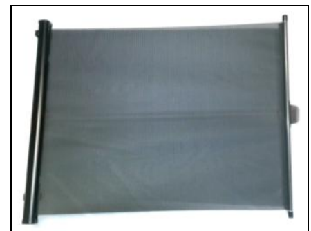
Shade in open position.

Nordco Parts 800-647-1724 Parts_Sales@nordco.com www.nordco.com