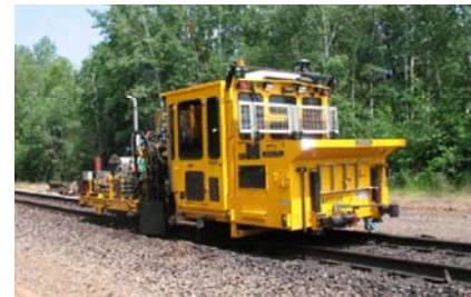
Nordco Bulkloader Walkway Kit 98410513 stored in the upright position for travel or spike loading.

Description: The Bulkloader Walkway extends over the bulkloader, providing a rigid platform for the service technician in the field or in the shop. It makes it easy to reach the air conditioner, travel lights, work lights and rear window. The Bulkloader Walkway is constructed of strong, lightweight aluminum. The Walkway stores in an upright position against the back of the cab when loading spikes, helping to protect the rear window. It includes a ladder that can be attached to both sides of the bulkloader. Handrails provide three-point-contact.