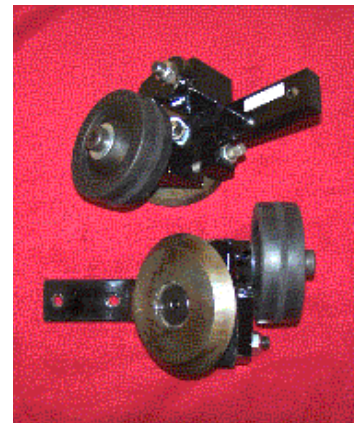
Gager Wheel Buggy Assemblies, 98410063 Right Hand (top) and 98410062 Left Hand.

Contact Nordco Parts Sales for assistance with all of your machine parts needs.