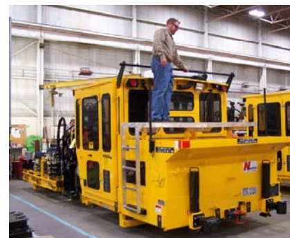
Handrails provide three-point-contact. The vertical handrails are stored on the sides and the ladder on the rear of the bulkloader when not in use.

Featured in next issue: CX Hammer Swivel Seat Kit