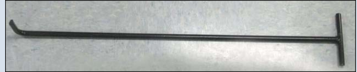
80200001 Anchor Rake.

This handy tool is specifically designed for breaking up anchors in the bin and raking them toward the operator. Used with all Anchor Applicators Model D, E and F, and all BAAM Anchor Applicators.