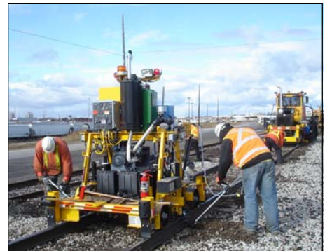
Nordco Auto-Lift Rail Lifter.

Description: Includes Rail Clamp Cylinder, Roller Clamp Arms assembled with Rollers, Pivot Links, Clamp Lock Links, Lock Valve Cartridge & hardware. Insulated, services one side of the machine.