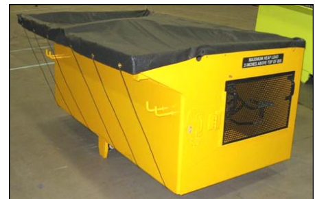
98410550 Bulkloader Cover on bin.