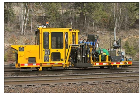
Nordco CX Hammer with Bulkloader.

Description: Heavy-duty vinyl cover with grommets specially designed to fit CX Hammer BulkLoader. Cover secures with rope or bungee cords to completely cover bin. Cover is large enough to allow slight mounding of spikes. Maximum heap load 3 inches above top of bin.