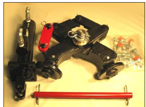
96790052 Rail Clamp Assembly.