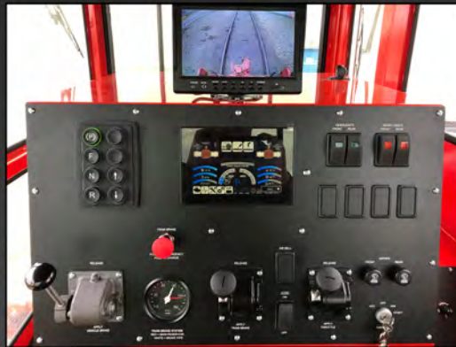
180 degree rotating console with multifunction display. Dual four-way air suspension seats for operation from either side of cab when in rail mode.