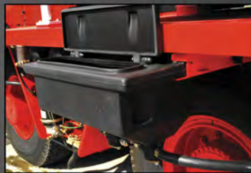
Pull out sander boxes with wide mouth lids for easy loading. Air activated sanders for smooth dispensing.