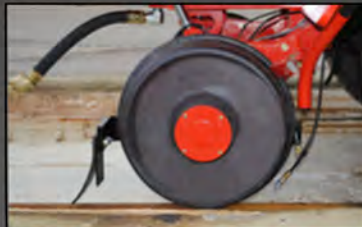
Powerful air knife increases capacities up to 50% in adverse weather.