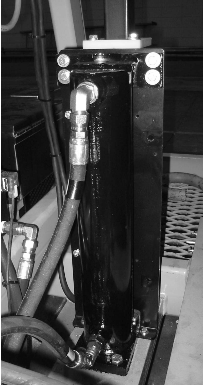
Figure 1 (Machine Lift Cylinder 28552671)