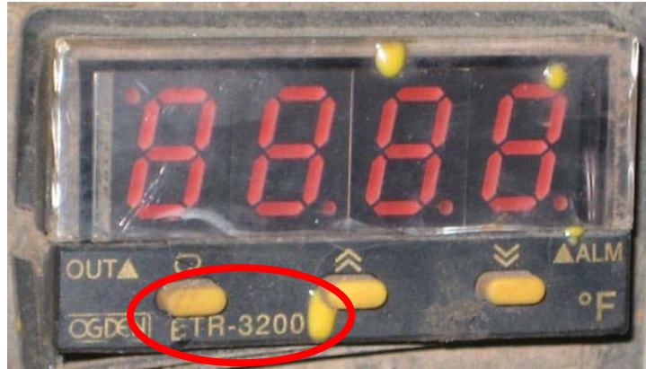
Figure 1- Original Controller

Original ETR-3200 Temperature Controller – 26605120