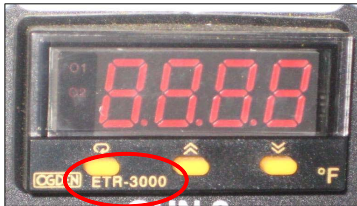
Figure 2 – Replacement Controller

NOTE: The white wire is connected to terminal #11 on this controller.